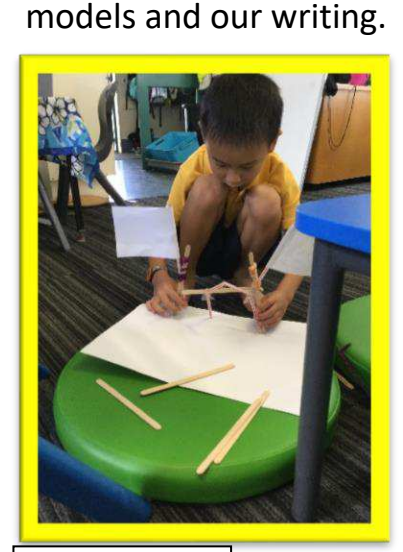
Fly creating the same.