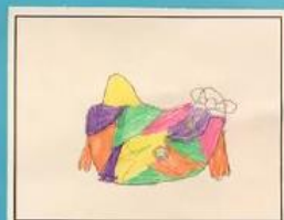
The Hello Kitty