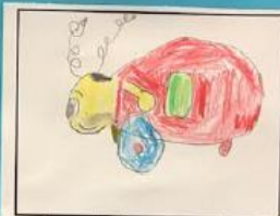
I Went To D