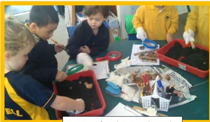
Digging for dinosaur bones!

disaster caused dinosaurs to become extinct!