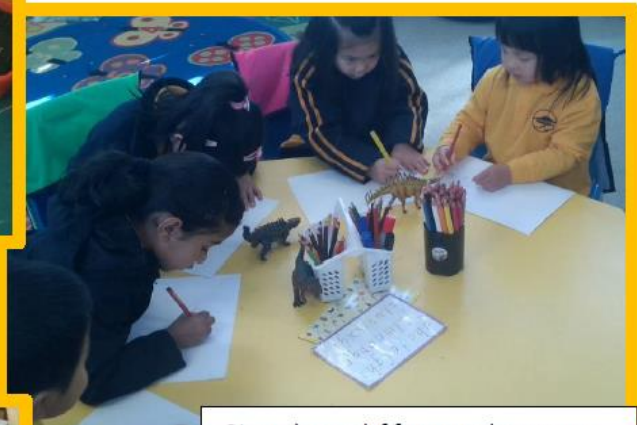
Sketching different dinosaurs