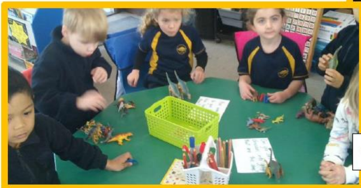
Sorting dinosaurs into groups