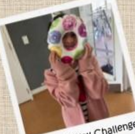
Sculpey Clay Challenge