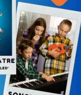
SONGWRITING + RECORDING & MUSIC VIDEO